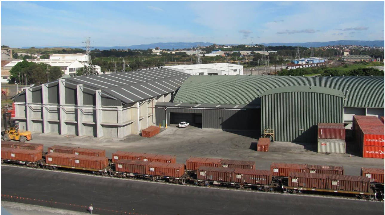
Figure 2: PKG Concentrate Storage Sheds at Port Kembla Outer Harbour.