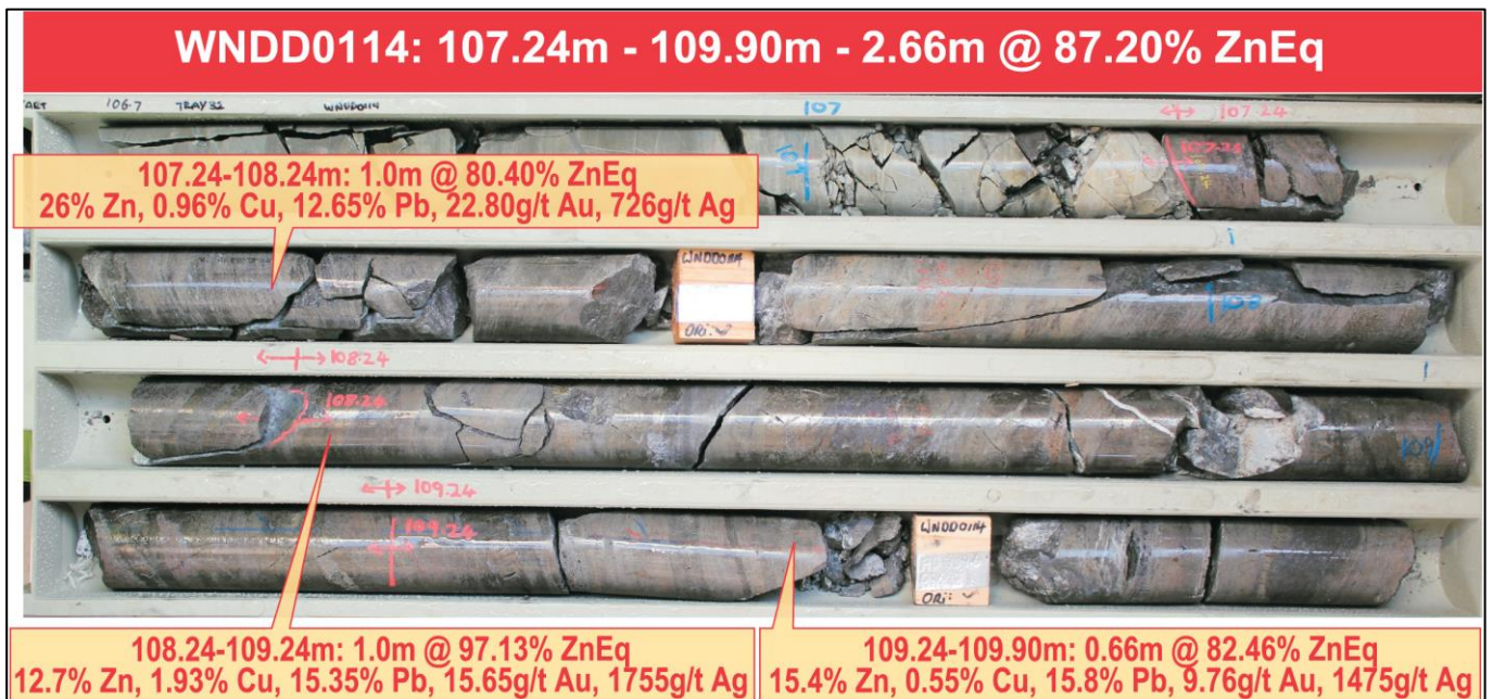
Figure 1: Part of the high grade zone of mineralisation intersected in WNDD0114 within the main G2 Hanging-wall Lens (G2HW). Up-hole direction is to the left in the tray.